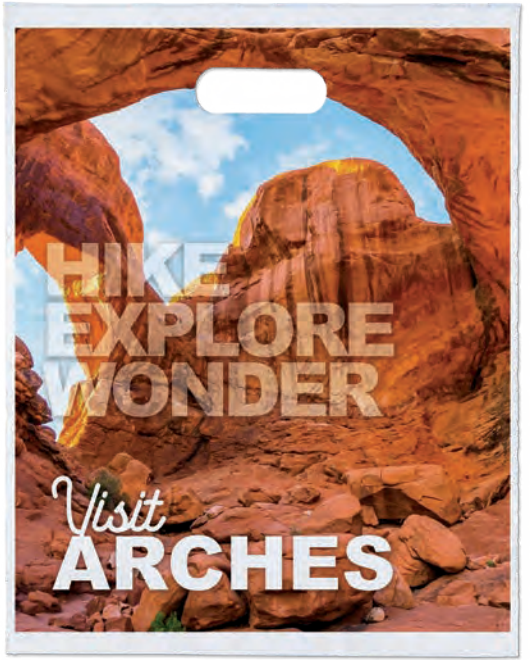
WHITE 12W x 15H