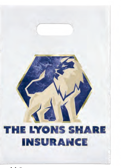
**CLEAR 9W x 13H

Digital Full-Color imprints offer a generous imprint area, crisp colors, and exceptional clarity for small fonts, fine lines, and details. Select 2.0 mil plastic bags feature a bottom gusset for more storage space.