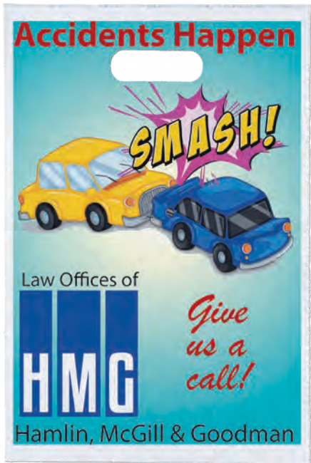
WHITE 10W x 15H